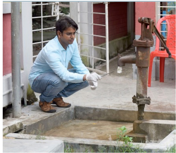
Figure 4: Water quality testing by the SafePani project