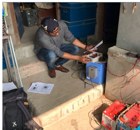
Figure 3: Locally constructed solar-powered incubators in Nepal