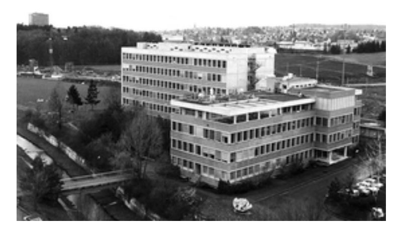
Founded in 1936, Eawag moved into the new buildings at Chriesbach Dübendorf in 1970, with the office building at the front and the laboratory building at the back. In the background the suburban railway under construction.