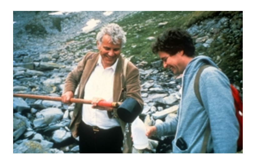
Werner Stumm and Jerry Schnoor during field work on an "acidic" lake in Ticino.

The fact that Switzerland can boast so many clean rivers and lakes today is due significantly to Eawag and, indeed, Werner Stumm, who headed the institute from 1970 to 1992. A chemist, he was of the opinion that environmental processes could only be understood if research was conducted into fundamental processes at a molecular level. He and his scientific colleagues therefore transferred laboratory research in the test tube to the complex material and impact cycles in nature. They identified the fact at an early stage that chemistry on its own was inadequate to research these, and that it was vital to also examine geological, biological, physical and ecological aspects. This was a pioneering approach from Eawag, examining as it did environmental phenomena and problems in a holistic manner which also transcended different disciplines. The new research field of environmental chemistry was born.