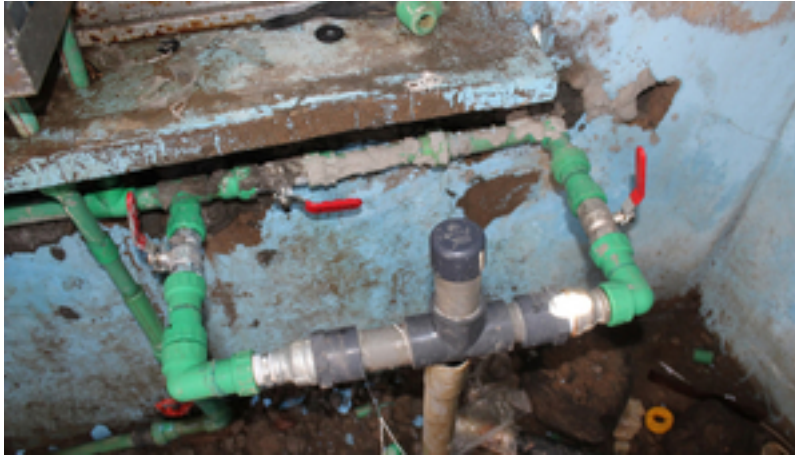
Passive, locally manufactured chlorination system installed in a water kiosk in Kenya.

The installation of the tap-attached AkvoTur was the fastest and the easiest. It was robust, easy to operate and had a dosage consistency of 69%. The T-chlorinator, however, had a better overall performance. Even though it was more complicated to fabricate and install, it was more robust and had a higher dosage consistency (89%) if automatic drainage was available. The automatic drainage ensures that the water can drain from the T-chlorinator by gravity.