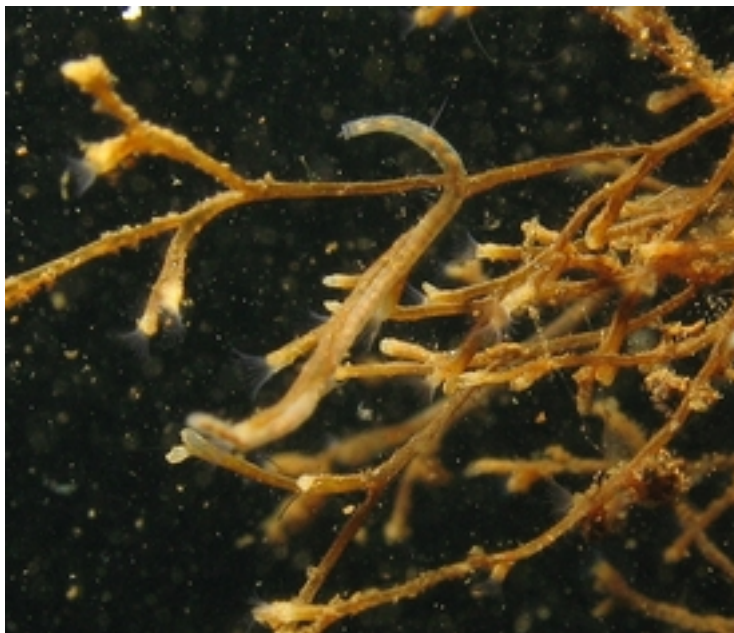
A colony of Fredericella sultana