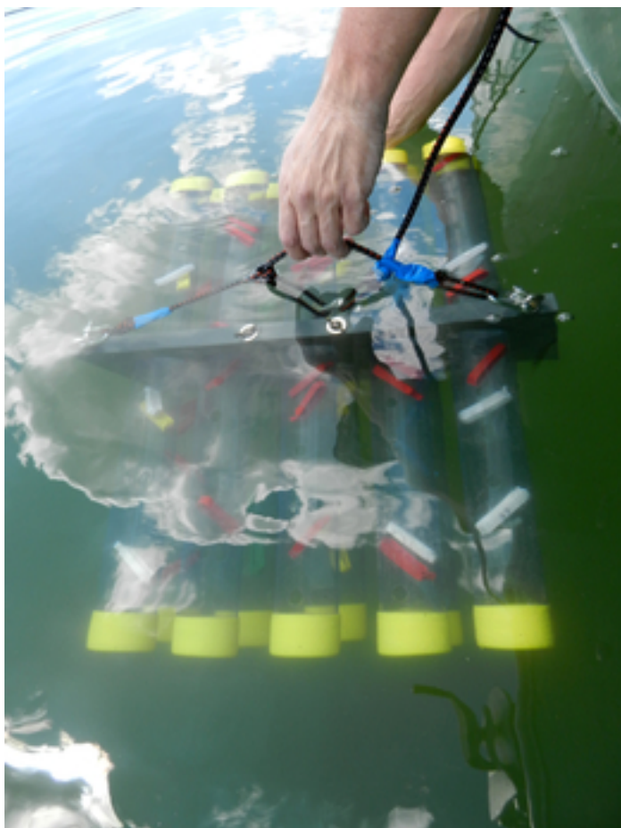
Left: The type of bag used for the experimental phytoplankton communities (microcosms). Right: The microcosms were deployed in tubes at depths of 1, 3 and 6 metres in Greifensee.