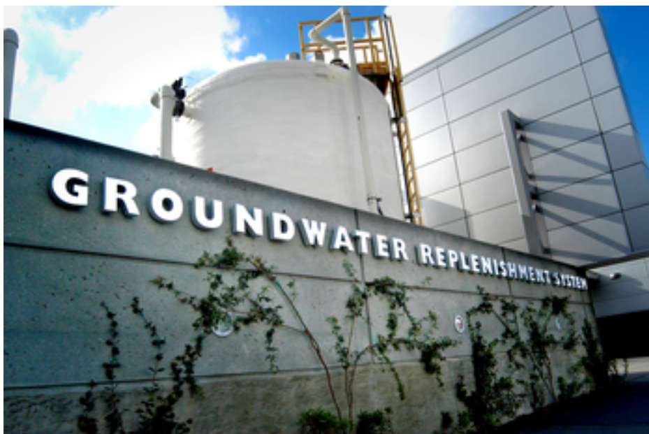
Fig. 3: The name chosen for the new treatment system also promoted legitimization of the project among users in

According to the study, public attitudes were also favourably affected by the choice of name – groundwater replenishment system (Fig. 3). Rather than suggesting a new, unfamiliar technology, this name led the public to associate potable water reuse with the practice of adding freshwater to groundwater so as to prevent saltwater intrusion into the aquifer – which OCWD had already been doing for decades. In addition, by consistently using the term "water recycling", OCWD linked the technology to an idea which was already taken for granted by most people in their daily lives. Consequently, environmental groups were among the first to support the new system.