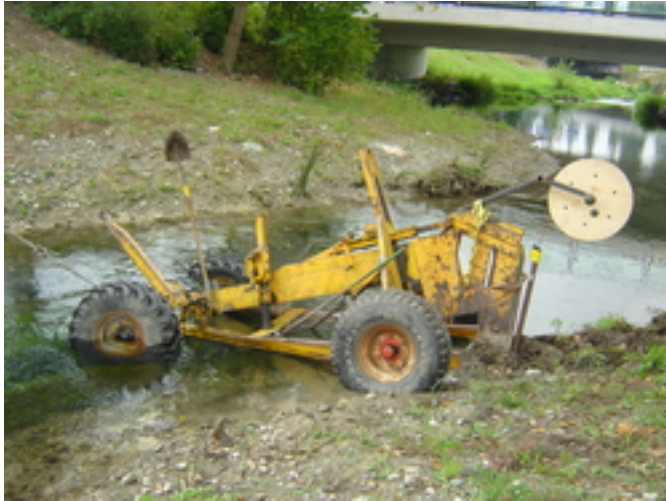
Fig. 2: Plough specially designed to