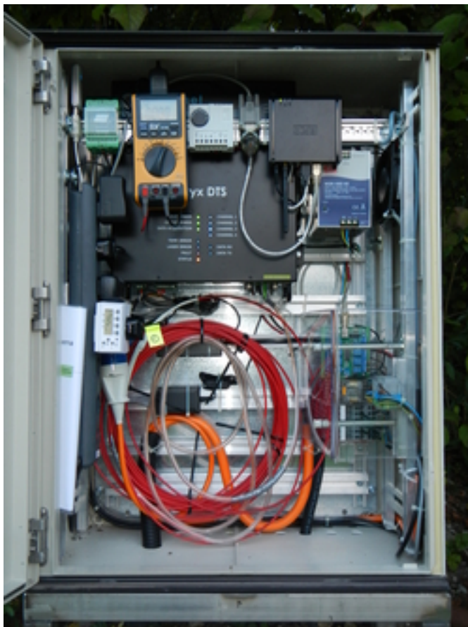
Measurement system used for fieldwork on the Chriesbach.

For the Chriesbach study, a fibre-optic cable was buried in the streambed at a depth of 40 centimetres with the aid of a specially designed tractor-pulled plough [Fig. 2]. After restoration work had been completed, active and passive DTS measurements were performed in summer 2014 [Fig. 1 and 3]. Although this experimental set-up, as Kurth concedes, is elaborate and relatively costly, there is no risk of equipment being lost during flood events, which means that long-term monitoring is possible.