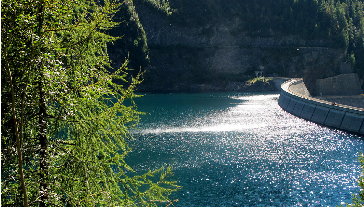
The Lago di Luzzone dam.