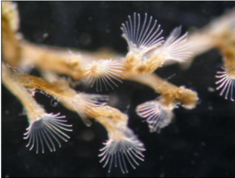
Part of a bryozoan-colony (total ca. 5mm). (photo: bryozoans, 2017)

are then excreted into the river water as spores and enter fish through their gills and mucous membranes, where the disease first breaks out before attacking the kidneys. The spores are subsequently released through fish urine and can, in mutated form, infect colonies of bryozoans. This means the parasite needs both bryozoans and fish to multiply and mutate. T. bryosalmonae contamination generates few symptoms in cold water but becomes apparent when the water temperature stays above 15 degrees Celsius for several weeks. Its deadly effect on both farmed and wild fish therefore lasts from the summer through early fall. Infected fish that manage to survive may continue excreting spores for several seasons. The researchers had to look at all such biological factors in order to model outbreaks.