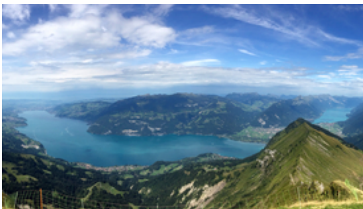
View of Lakes Thun (left) and Brienz.

In the journal ZooKeys , a group of scientists from Eawag and Bern University have described seven whitefish species endemic to the Bernese Oberland lakes – including four not previously described scientifically, two of which have only been identified as distinct species in the last few years. In Switzerland, the whitefish diversity of Lakes Thun and Brienz is possibly matched only by that found in Lake Lucerne; and in deep lakes of this kind further surprises cannot be ruled out.