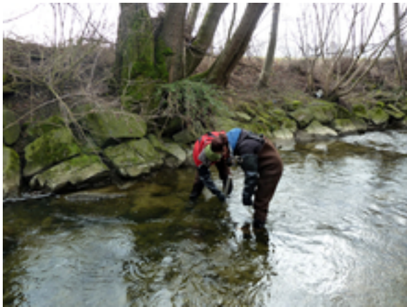
Taking samples from Salmsacher Aach.

Anzahl gefundener Herbizide, Fungizide und Insektizide pro Untersuchungsstation (als Pflanzenschutzmittel sowie doppelt, als Pflanzenschutzmittel und Biozid zugelassene Wirkstoffe).