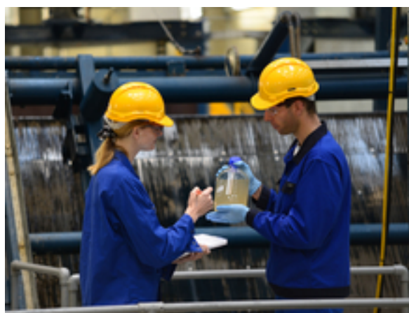
Sampling wastewater at the Werdhölzli wastewater treatment plant in Zurich