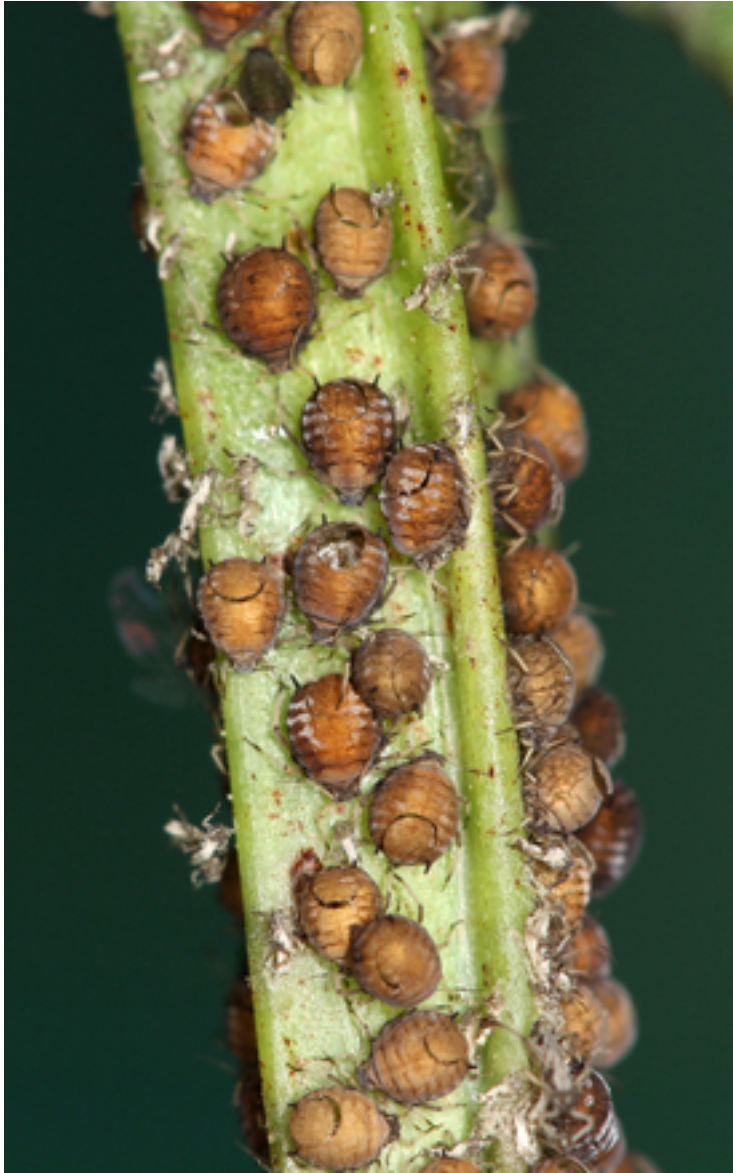
The gruesome signs of successful biological control. Remains of black bean aphids ( Aphis fabae ) that have been successfully parasitized and 'mummified' by parasitoid wasps. The openings in the mummies are exit holes through which the adult wasps emerged after completing their development inside the host aphids.