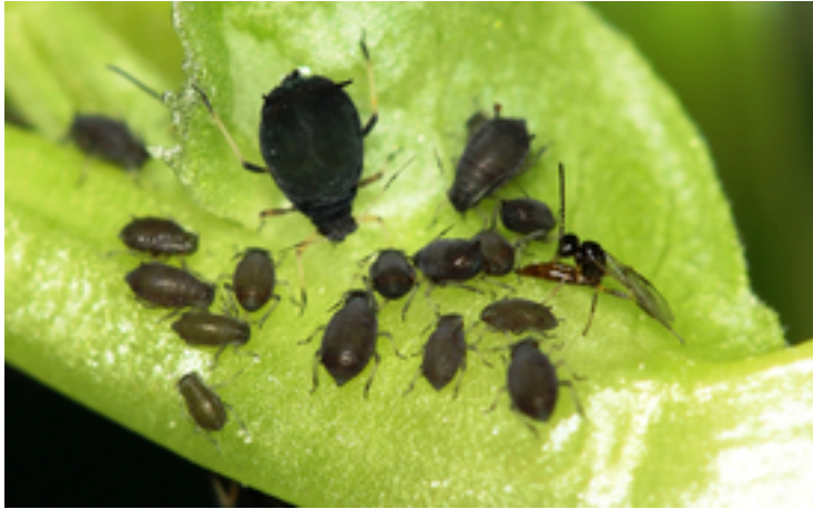
An adult female black bean aphid (Aphis fabae) and several of her clonal offspring under attack a by an ovipositing female of the aphid parasitoid Lysiphlebus fabarum.