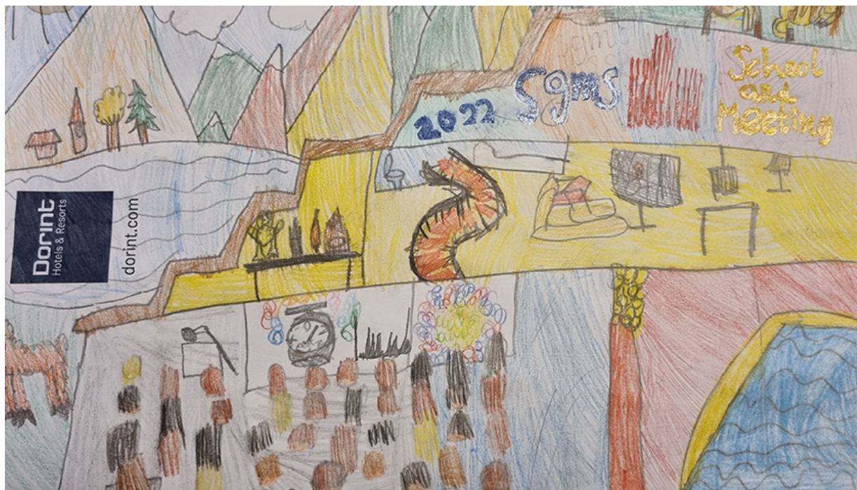
SGMS 2022 Best Drawing Award for Agafia Groh