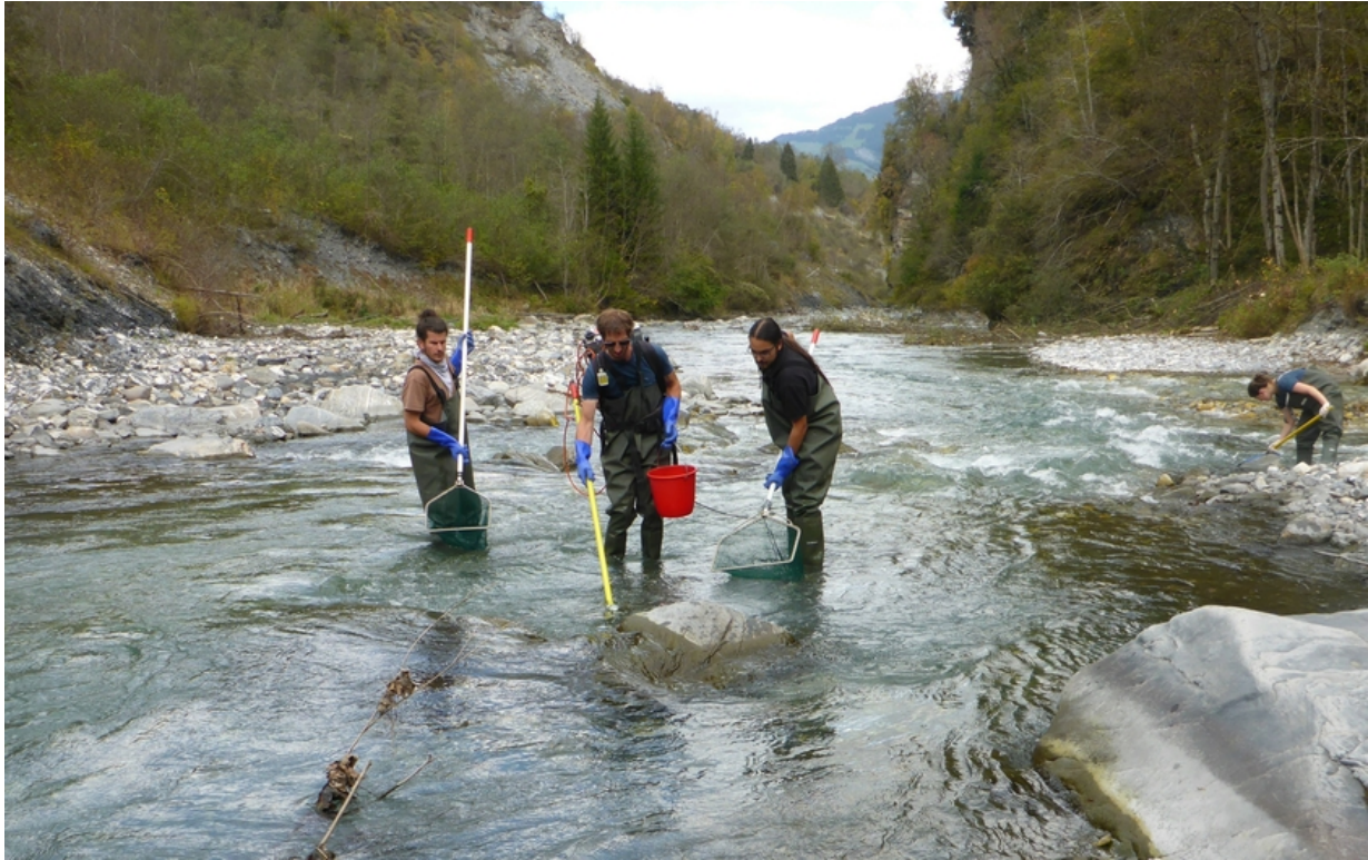
Electrofishing in the Glenner river.