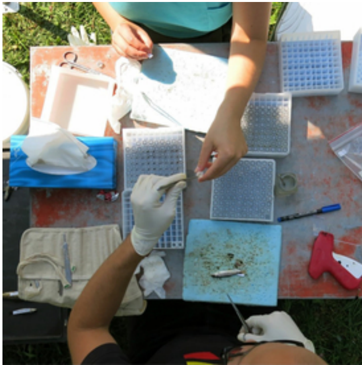
Retrieval of fin, scale and muscle samples for the reference collection.