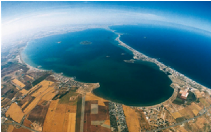
The “Mar Menor” in the Spanish province of Murcia is Europe’s largest salty inland water body.

The researchers intend to use the hydrogeological model in a second stage of their investigations, to estimate how new drainage systems, additional groundwater usage or climate change might affect groundwater flows into the Mar Menor. The aim is to optimise water management in the region so as to protect the unique lagoon from over-fertilisation. Whether it is not already too late for that remains to be seen.