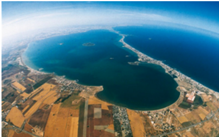
The “Mar Menor” in the Spanish province of Murcia is Europe’s largest salty inland water body.

The researchers intend to use the hydrogeological model in a second stage of their investigations, to estimate how new drainage systems, additional groundwater usage or climate change might affect groundwater flows into the Mar Menor. The aim is to optimise water management in the region so as to protect the unique lagoon from over-fertilisation. Whether it is not already too late for that remains to be seen.