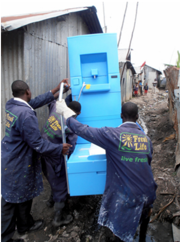
Local residents carrying a Water Wall through Mukuru, an informal settlement in Nairobi, where this earlier model was field-tested in 2015.

The next two-month field test is to take place in an informal settlement in Durban (South Africa), where the system is to be installed in January 2019. The researchers will be investigating whether and how well the system performs over an extended period in this type of setting.