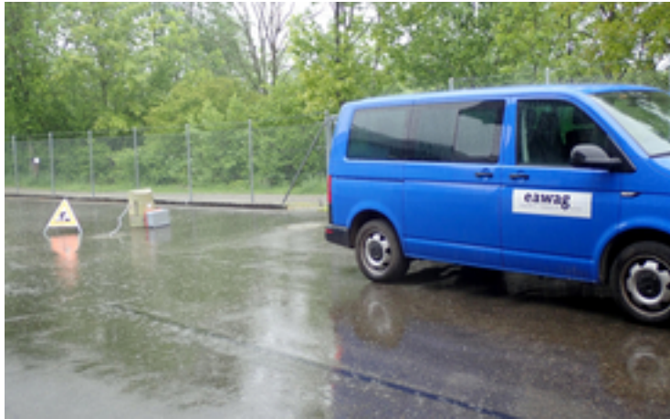
Sampling wastewater-bypass during stormwater events in a wastewater treatment plant in Münchwilen, Thurgau, Switzerland.

We wanted to document and quantify the extent of such contamination during heavy rainfall. This is challenging, because such events are relatively rare, and you have to be on site when they happen. For instance, even though these events occurred in Münchwilen on 118 calendar days in 2019, most did not last long. During heavy rains, many other potential sources of antibiotic resistance contamination enter the river, complicating our research further. This includes surface runoff that transports soil into the river, such as from fields and meadows that may have been manured. Sediment within the river is also resuspended by the faster flow.