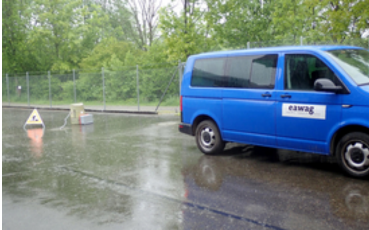
Sampling wastewater-bypass during stormwater events in a wastewater treatment plant in Münchwilen, Thurgau, Switzerland.

We wanted to document and quantify the extent of such contamination during heavy rainfall. This is challenging, because such events are relatively rare, and you have to be on site when they happen. For instance, even though these events occurred in Münchwilen on 118 calendar days in 2019, most did not last long. During heavy rains, many other potential sources of antibiotic resistance contamination enter the river, complicating our research further. This includes surface runoff that transports soil into the river, such as from fields and meadows that may have been manured. Sediment within the river is also resuspended by the faster flow.