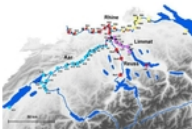
The barriers and sampling sites in the Rhine catchment at a