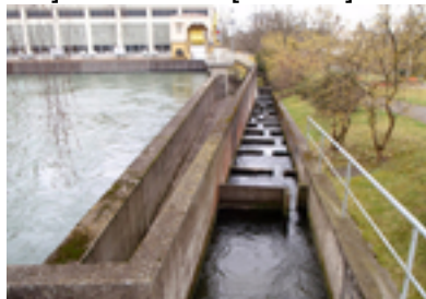
Fish ladders reduce the effects of barriers, but however not completely – here at hydropower station IBA Aarau