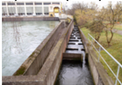
Fish ladders reduce the effects of barriers, but however not completely – here at hydropower station IBA Aarau