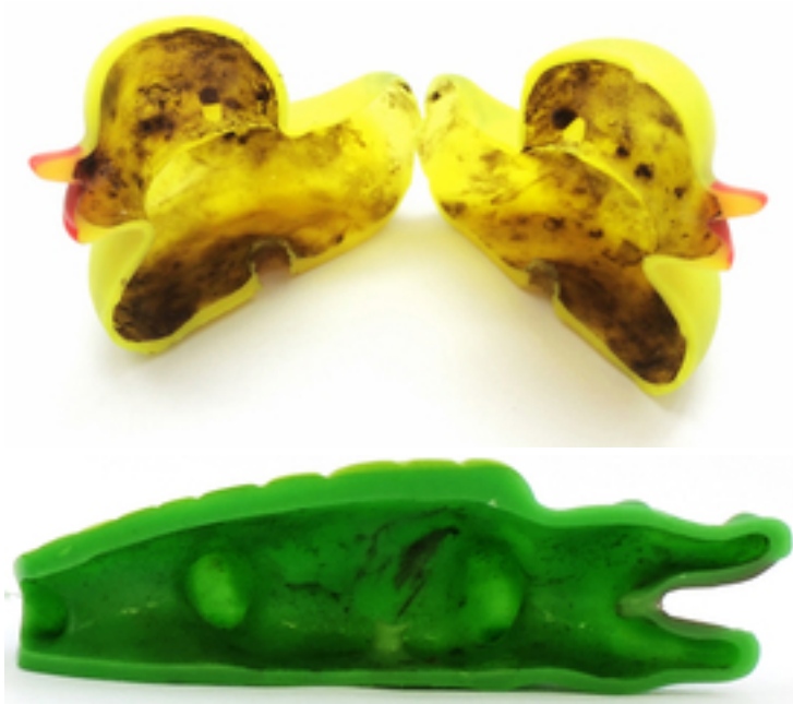
The “dark side” of bath toys.