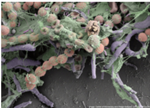
Scanning electron micrograph of a biofilm on the inner surface of a bath toy. Colours were added artificially to highlight the varied structures.