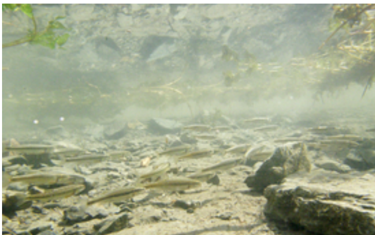
A shoal of minnows ( Phoxinus phoxinus ) in Lake Poschiavo.

Of a total of about 550 fish species now known in Europe, 106 were identified in the "Projet Lac". Although Switzerland accounts for only 0.4% of Europe's land area, it is home to almost 20% of the species. This makes it one of the regions in Europe with the highest diversity of fish species in freshwater. 15 (endemic) fish species, most of which are found only here, were identified and documented for the first time. In addition, five species were caught whose occurrence in Switzerland was previously unknown. Two species were found north of the Alps that were previously thought to occur only south of the Alps. And four fish species were rediscovered that were thought to be extinct, for example a char that lives at great depths in Lake Uri.