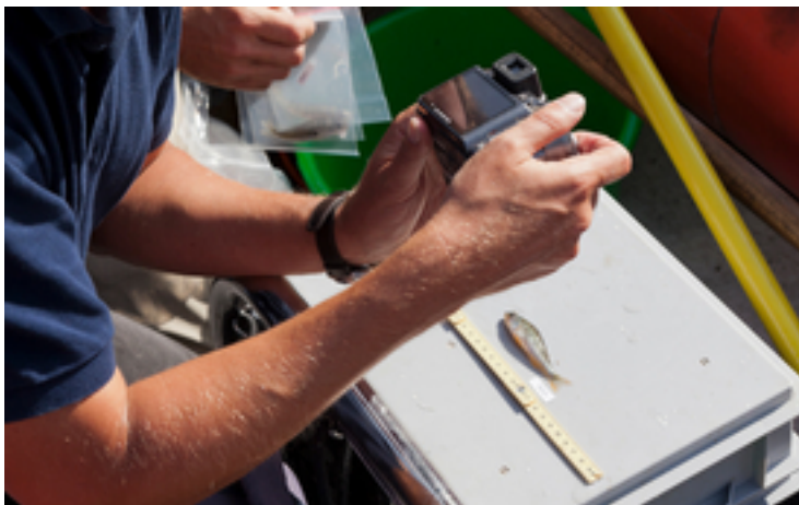
None too small for the large inventory: every fish from the systematic fisheries was measured, weighed and photographed.