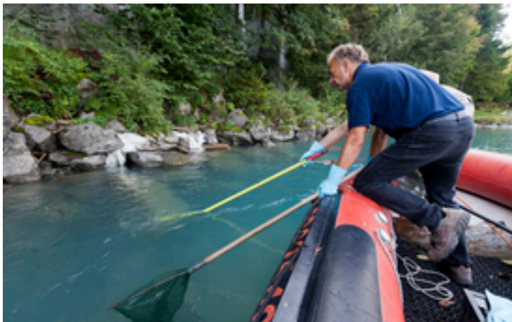
Such natural steep banks, here on Lake Brienz, provide habitats and refuges for numerous fish species. In Projet Lac, targeted fishing was also carried out here.