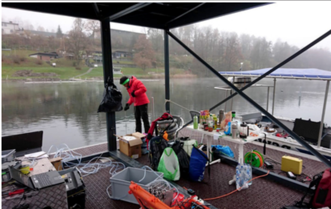
The measurements on Lake Rotsee were carried out continuously during day and night, for 48 hours in November. The researchers worked in shifts.