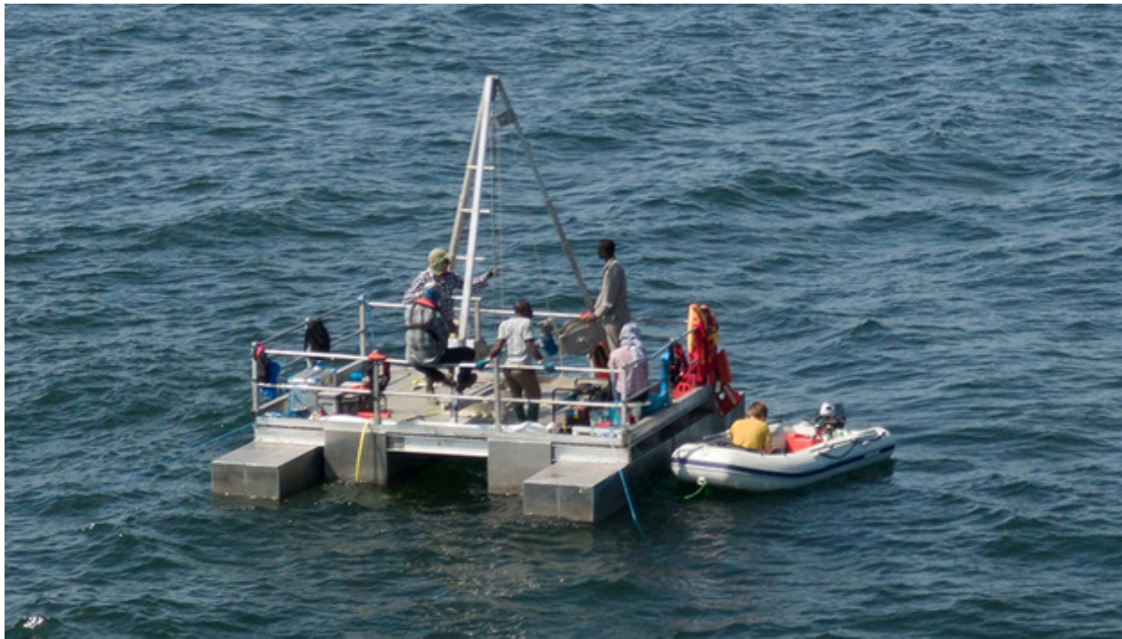
Field work on Lake Victoria