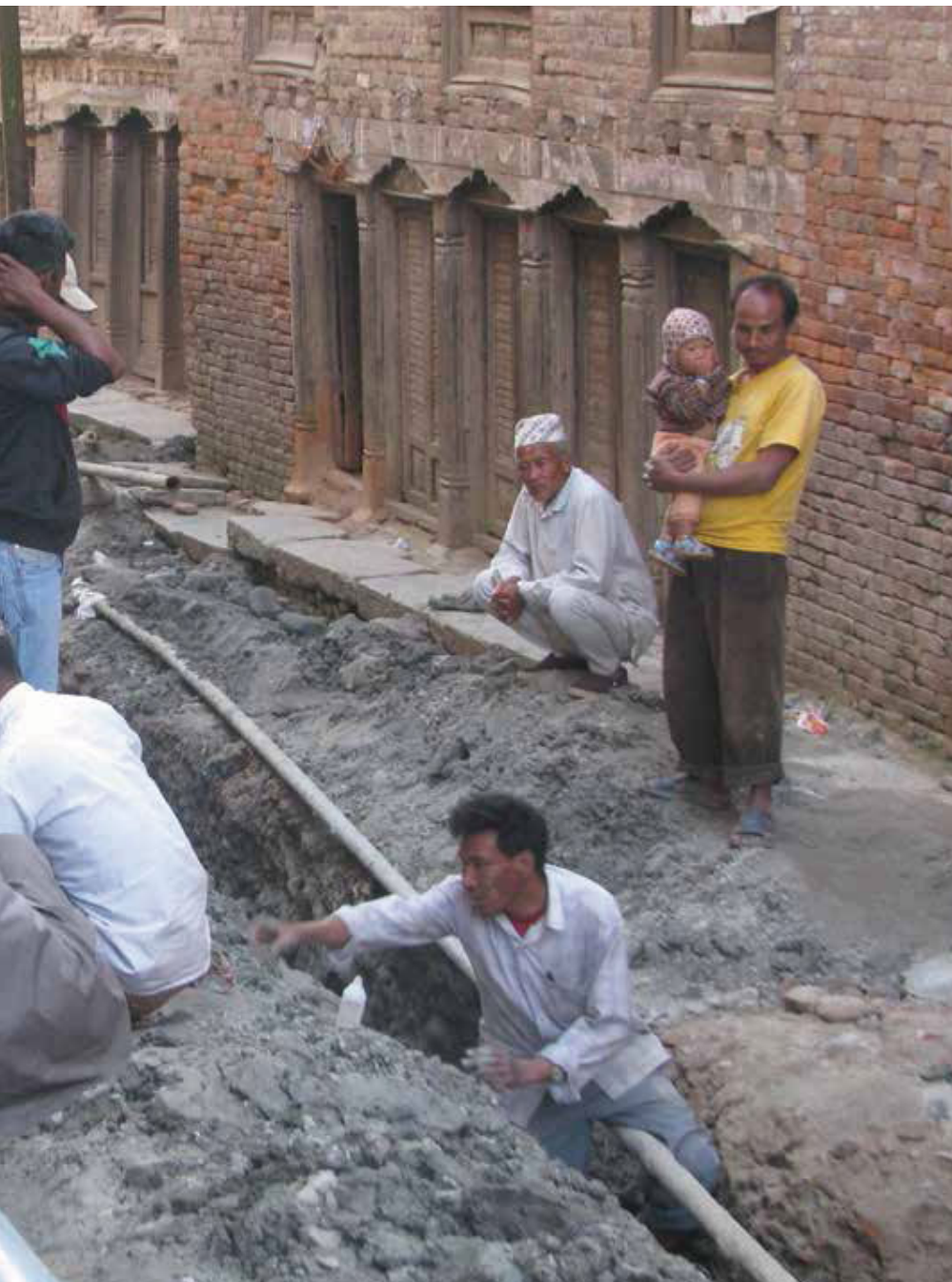
Simplified sewers are being installed in Nala, Nepal.

Source: Manila Principles on CWIS. Source: (Narayan and Lüthi 2019)