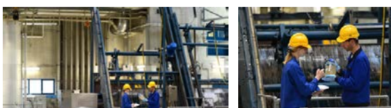
Sampling wastewater at the Werdhölzli wastewater treatment plant in Zurich

Original article: Spatial differences and temporal changes in illicit drug use in Europe quantified by wastewater analysis. Christoph Ort (Eawag), Alexander L.N. van Nuijs (University of Antwerp) et al. doi:10.1111/add.12570; download as pdf also from: medias Eawag .