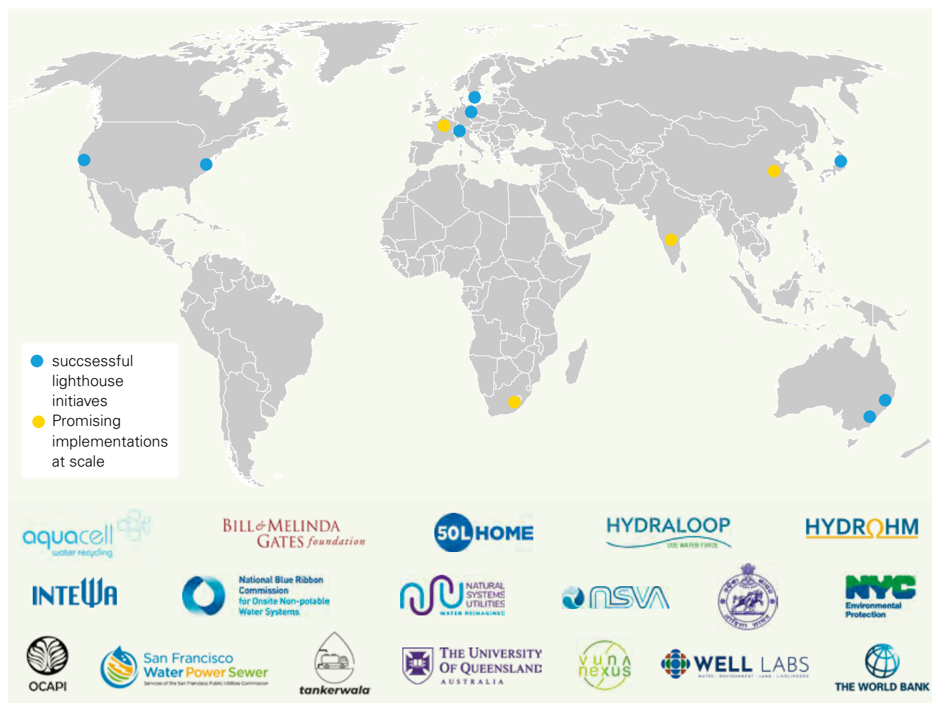
Figure1: Key lighthouse initiatives for decentralized solutions and organizations participating in the workshop.

Despite these significant benefits, decentralized UWM solutions have remained a niche solution. Few implementations at scale have occurred and if innovative decentralized UWM systems have been built, they were typically seen as one-of-a-kind demonstration or pilot projects that are hard to replicate or scale. Figure 1 outlines that this situation has quite dramatically changed over the past years. The figure on the one hand maps some of the most high-profile 'lighthouse initiatives' (also see Box 1-3) for decentralized UWM solutions, as analyzed in recent research projects. 1 On the other hand, it shows the organizations present at the workshop. The figure thus provides an indicative illustration that decentralized solutions are on a global expansion track and promoted not just by niche players anymore, but also by key utilities, investors, firms, technology experts and NGOs.